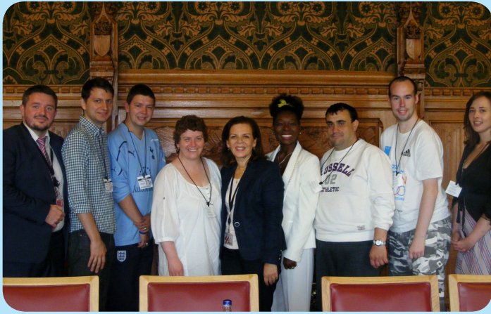
The Committee with Baroness Hussein-Ece and Baroness Benjamin.

The Leisure and Learning Committee were given an exciting opportunity to hold an away day at the Houses of Parliament. The committee, which includes service users, family members, volunteers and staff, help us to monitor the management of our services and ensure that we are offering the best for our members.